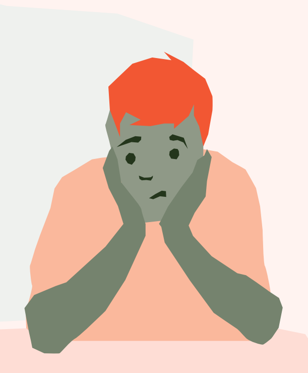
Figure 2: Common peer work challenges and solutions (8,9,11,21,26,29,30)

Table 4 provides a summary of associated stressors in the peer work role alongside some potential solutions. However, for more detailed information related to organisational responsibilities please refer to Orygen's peer work implementation toolkit for further information. Please also refer to part two of this clinical practice point, "How to peer." Youth peer workers' perspectives and advice about working in youth mental health services which provides specific feedback from established youth peer workers that may relate to some of the challenges and solutions identified in figure 2.